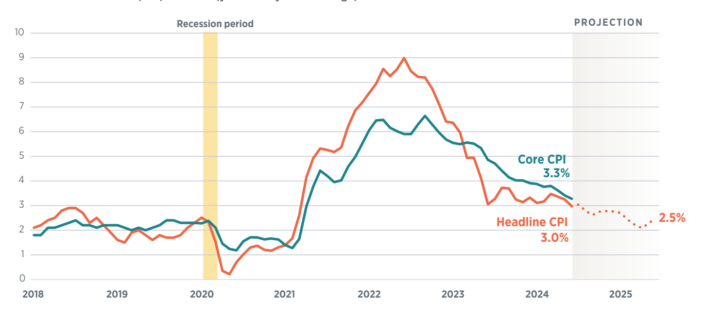
Figure 1 Inflation to continue to slow in 2024 Consumer Price Index (CPI) inflation (year-over-year % change)

Data as of 7/11/24. Sources: Bureau of Labor Statistics, WTIA.